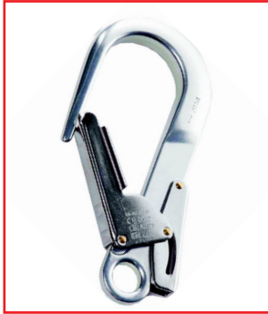
ARESTA Zeus Chrome plated scaffhook

Scaffhook for quick attachment to scaffolding units. Double locking type gate opening