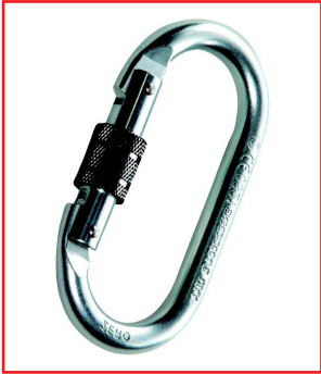
ARESTA Ox Screw Screw gate oval carabiner

Screw gate oval carabiner. Marked with individual serial numbers.