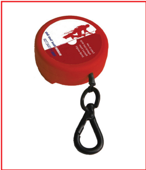
ARESTA Eos Tool holder

Retractable tool holder with the ability to connect to a belt. Use with hand tools only. Max tool weight: 2kg.