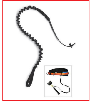
ARESTA Amax Tool lanyard

An elasticated tool lanyard for secure fixing of tools. Safe working load: 2kg. Length: 120cm. Static strength: 15kN. With toggle and quick connect catch